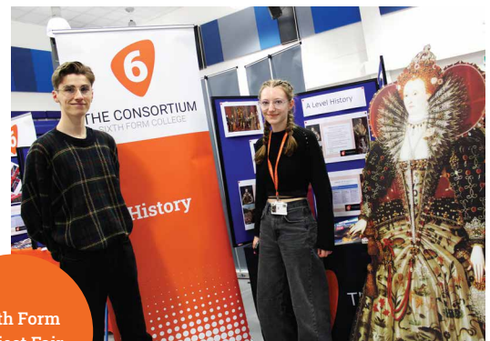
Sixth Form Subject Fair

Our campuses also have a great social community. Our Sixth Form Student Council focuses on the Sixth Form experience and plans events for everyone to take part in including charity fundraising events for various local and national charities and the Sixth Form Prom.