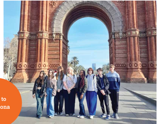
Visit to Barcelona