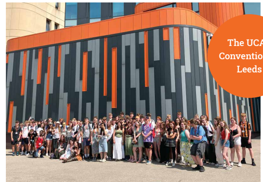
The UCAS Convention in Leeds