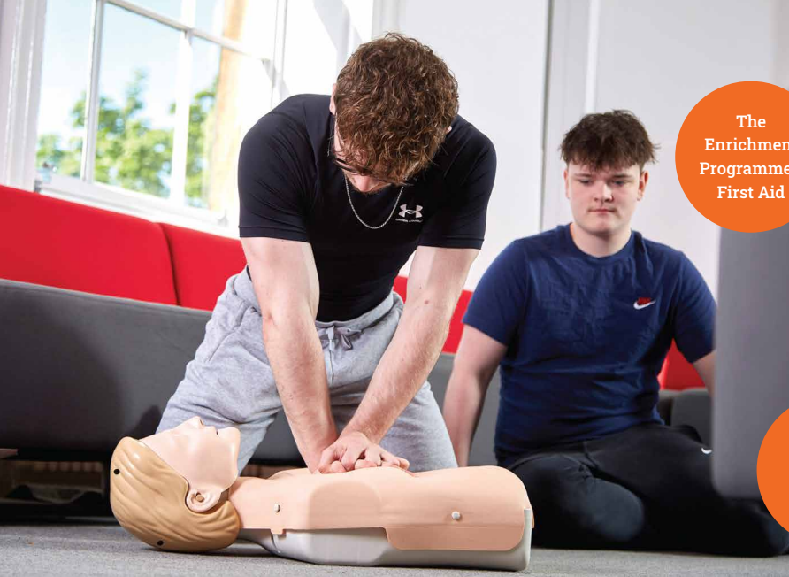
The Enrichment Programme - First Aid